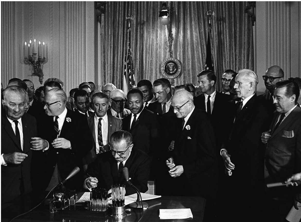
President Lyndon Johnson signs the Civil Rights Act of 1964 into law.

1964 – Multiple southern Senators conduct a 60-day filibuster of the Civil Rights Act of 1964. The filibuster is ended by a successful cloture vote on June 10. 13