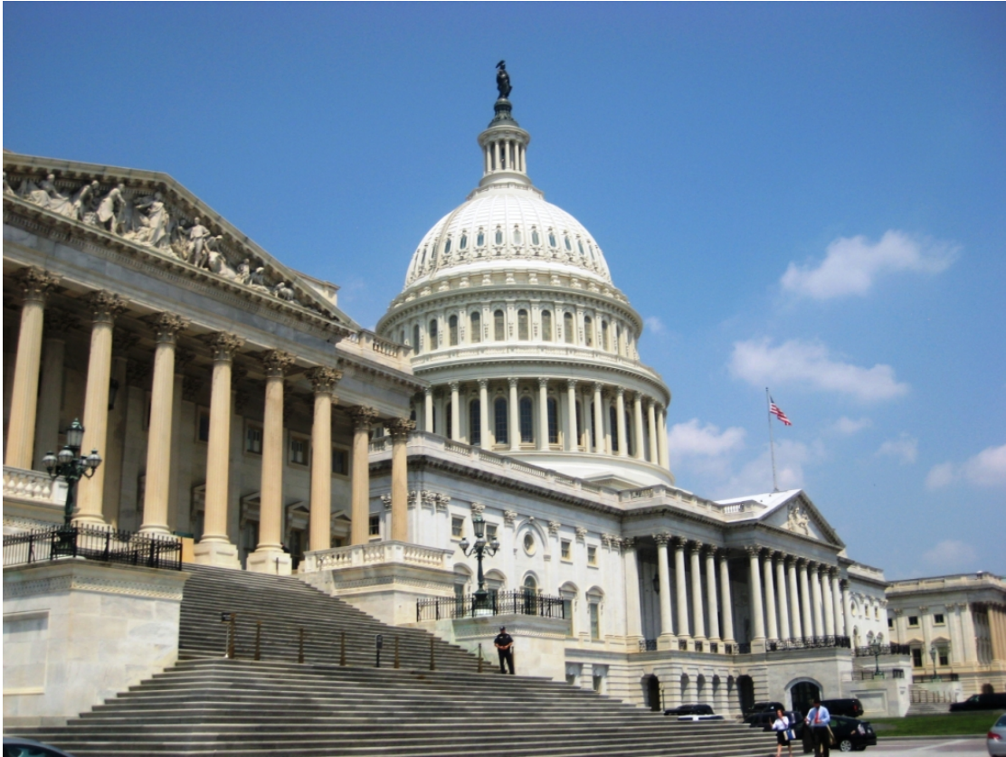
U.S. Capitol.

Senate Minority Leader McConnell: “One-hundred percent of our focus is on stopping this new Administration.” 40